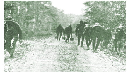
Advance in Meuse -Argonne