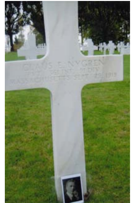
Nygren, PVT Claus E.

Family was there, moved by the unbearable and wasteful loss of life and of 14,245 others, most of them died in the unimaginable horrific battle of Meuse-Argonne, September 25 to November 11, 1918. The grave markers fill some 100 acres near where they fought and died. Now large beech trees and well kept grassy walks separate eight plots, lettered A to H. Uncle Klas lies in plot H, row 34, grave 30.