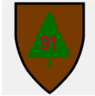
91st Division Arm Insignia