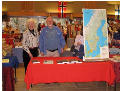
SRIO Booth at ScanFair