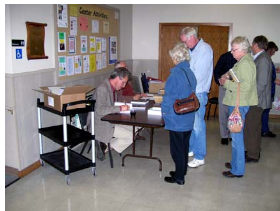
Crowd eagerly awaiting their signed book